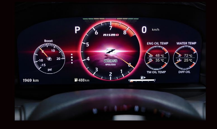
Photo may vary from actual unit. Nissan Philippines, Inc. reserves the right to alter, delete, or enhance features and specifications without prior notice, depending on market requirements.

A sports car is all about the connection between driver and machine. The unique instrument display is another NISMO tradition and helps you keep tabs on Z NISMO's thrilling performance stats.