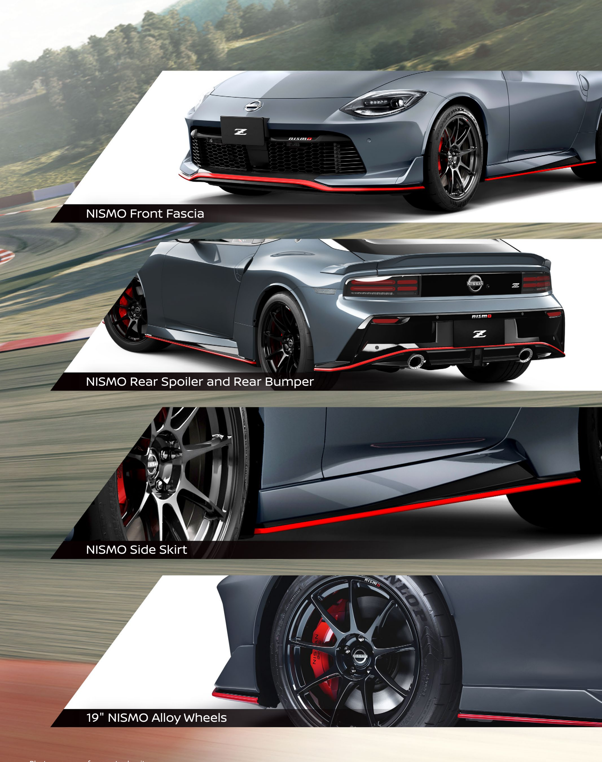
Photo may vary from actual unit. Nissan Philippines, Inc. reserves the right to alter, delete, or enhance features and specifications without prior notice, depending on market requirements.