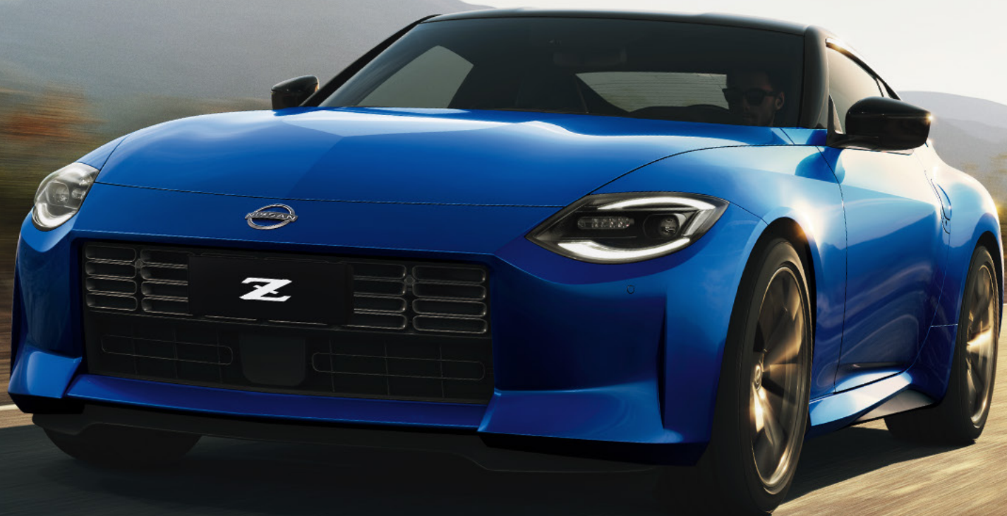
Photo may vary from actual unit. Nissan Philippines, Inc. reserves the right to alter, delete, or enhance features and specifications without prior notice, depending on market requirements.

Trends come and go, but some things never go out of style. The Nissan Z is an icon redesigned for the modern era of excitement, with an exterior that pays homage to previous Z models, an array of Nissan Intelligent Mobility technology, and the exhilaration of a V6 Twin-Turbo engine.