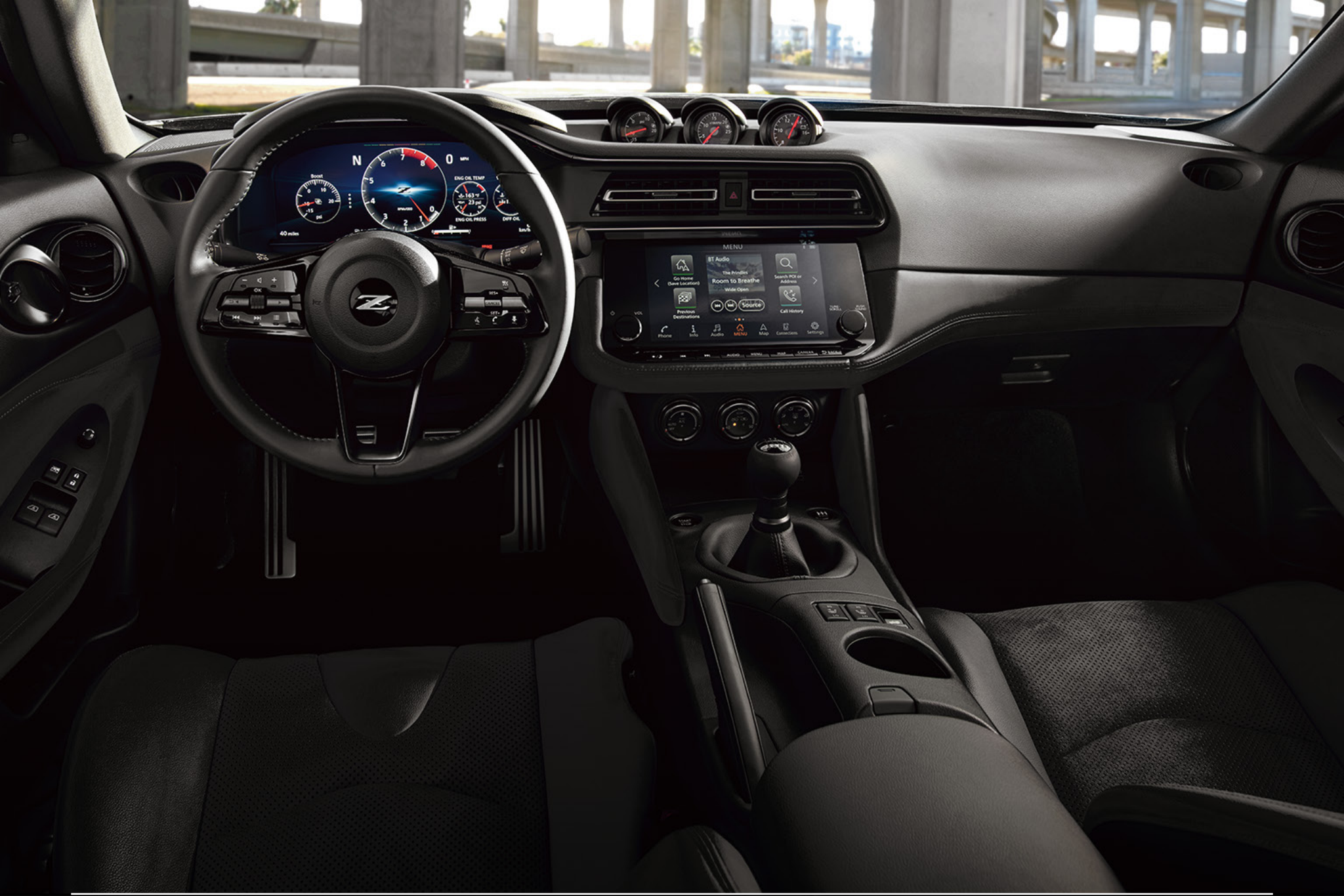
Graphite Leather / Synthetic-Suede