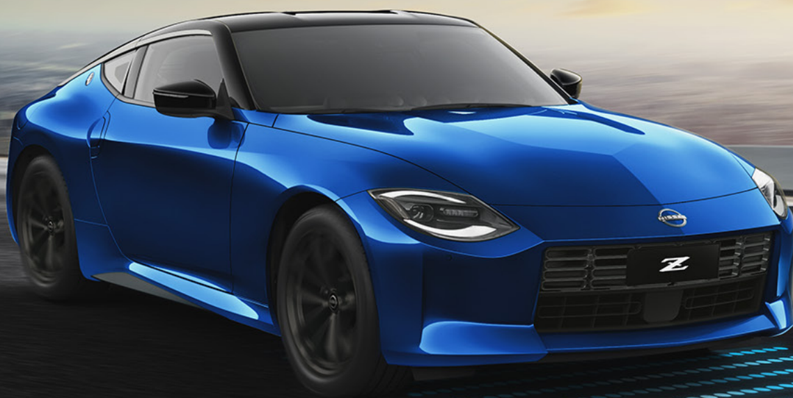
Photo may vary from actual unit. Nissan Philippines, Inc. reserves the right to alter, delete, or enhance features and specifications without prior notice, depending on market requirements.

Monitors your speed and distance between you and the car ahead and lets you know if you need to slow down. It can also automatically engage the brakes to help avoid a frontal collision or lessen the severity of an impact. It also engages the brakes when it detects a pedestrian in the crosswalk.